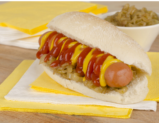
Hot Dog Buns