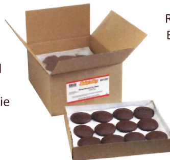
Ready to bake Elephant Ears