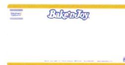
Sample of Kitchen Cupboard Clean Label packaging label.

Predeposited 4.5 oz. Muffins Case pack—example only Case pack contains 4 layers 24 units per layer = 96 units