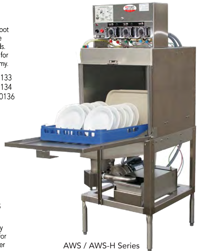
AWS / AWS-H Series Perfect dishmachine for small spaces.

Tight on space? Tired of manually washing? Give us a call!