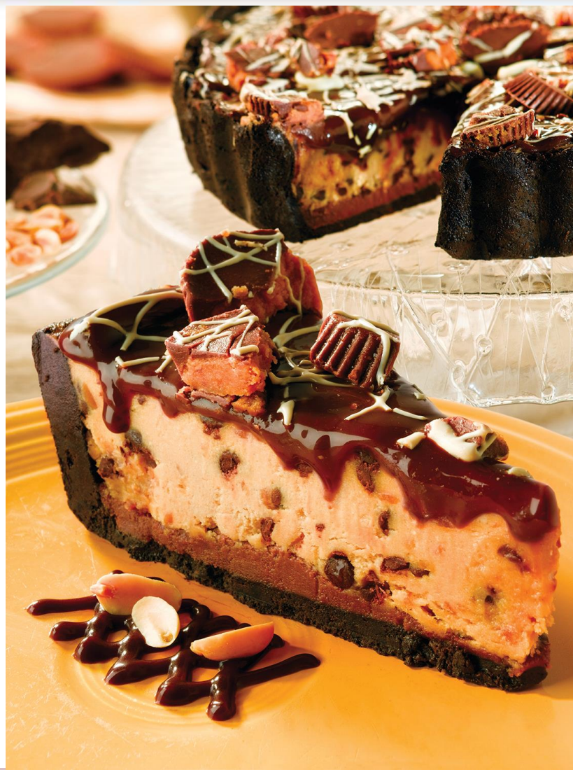
PEANUT BUTTER HIGH PIE MADE WITH REAL REECE'S CUPS #7692111