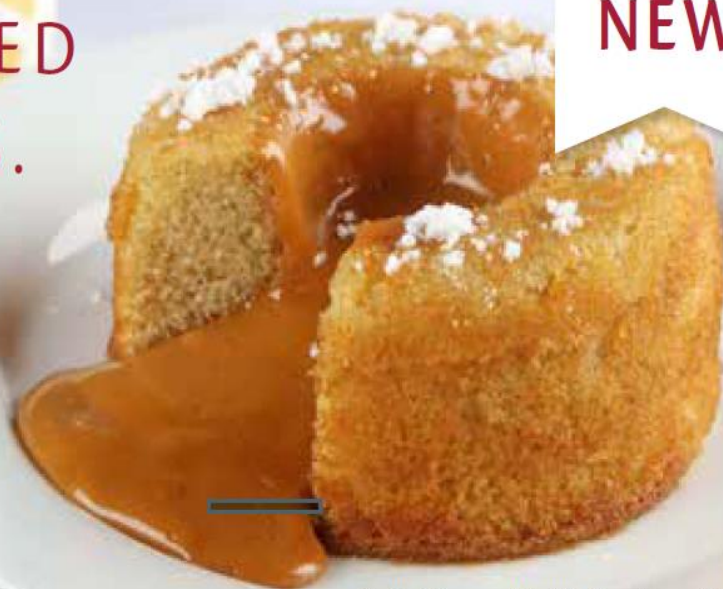
Salted Caramel Vanilla Bean Lava Cake